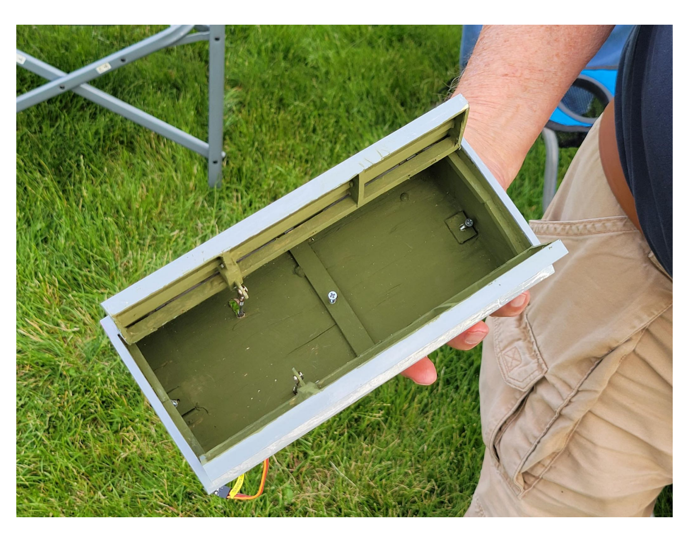
Inside of Jim's bomb bay.