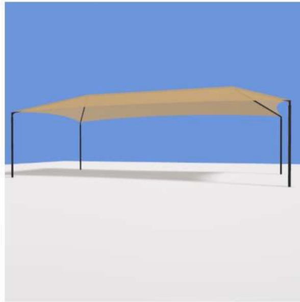
Structure Q-062239 Details