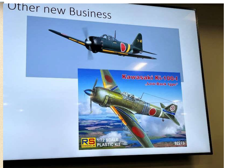
Figure 6-Todd Davis brought in the DLE 130 engine that he is going to use in the KI-100 plane that he is building. The plane he is putting it in is pictured above.