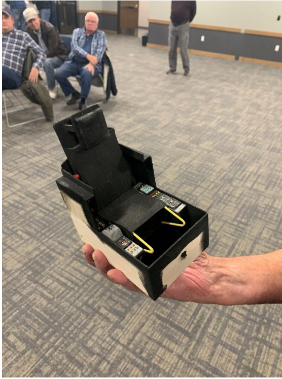
Figure 3-Gene's A-4 Skyraider cockpit with the ejection seat inserted.