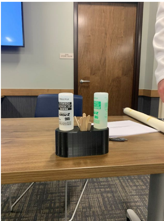
Figure 5-Randy Lepsch created an Epoxy bottle holder with his 3-D printer