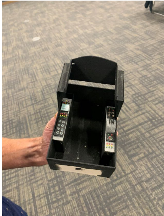
Figure 4-Gene Thorn's cockpit without the ejection seat inserted