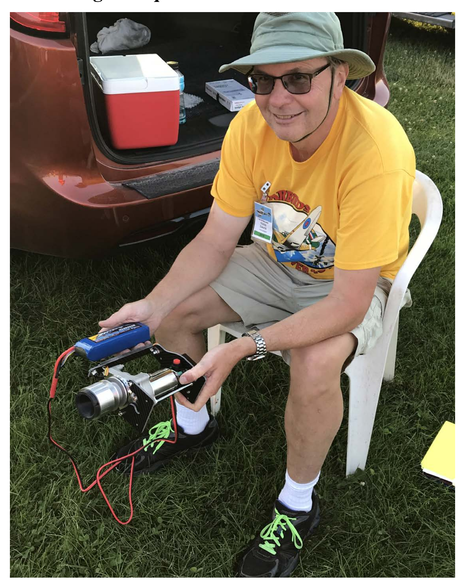
Todd's High Torque Starter