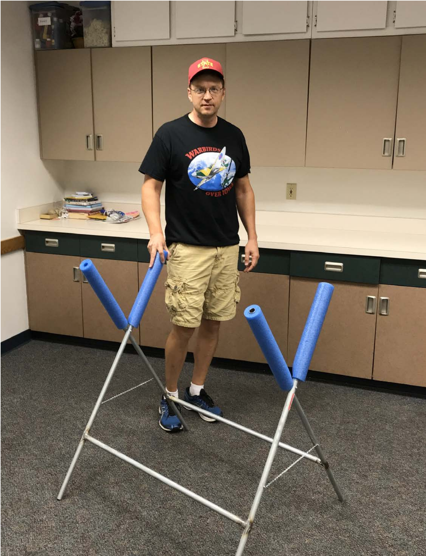
Randy's airplane stand