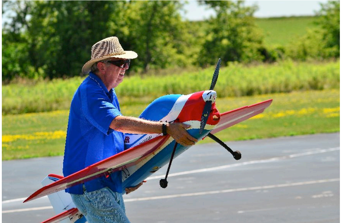
Doc with plane