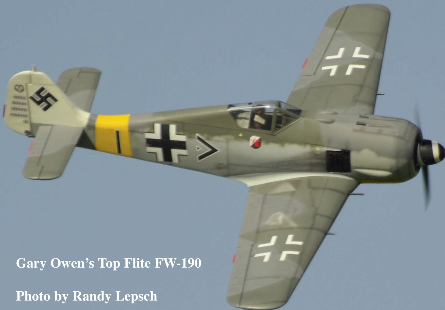
Gary Owen's Top Flite FW-190