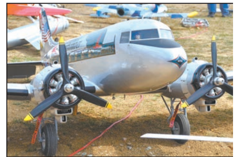
Niehus, of Coralville, built this 1/6th scale radio-controlled replica of a C-47 cargo plane in honor of American pilots who dropped candy to children in Berlin during the famous Berlin Airlift.

The bottom line: pilots have a sweet spot for kids.